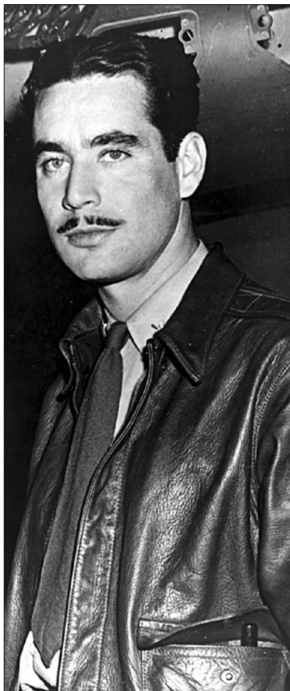
Boyd Wagner is the first AAF ace of World War II.

Thus, the standards for World War II and Korea were more restrictive than those for World War I and Vietnam.