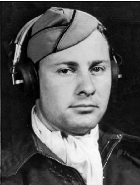
Horace Carswell Jr.