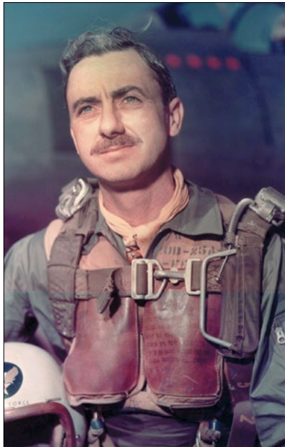
Vermont Garrison (10)