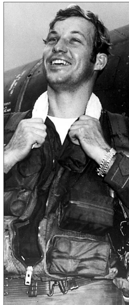
Richard Ritchie is the first USAF ace of the Vietnam War.