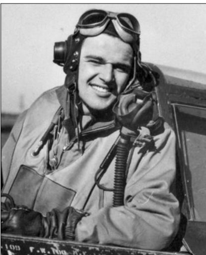
Walker Mahurin (20.75)

Ranks are as of last victory in World War II.