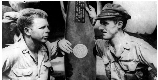
The top two scoring aces of WW II, Richard Bong (left) (40) and Thomas McGuire Jr. (38).