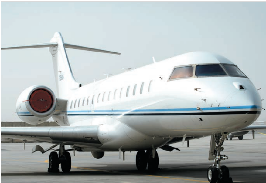
E-11A Battlefield Airborne Communications Node

• E-11A. Modified Bombardier BD-700 equipped with the BACN payload. Function: Communications relay. Operator: ACC. First Flight: Oct. 6, 2003 (BD-700). Delivered: Dec. 2008-Aug. 30, 2012. IOC: Circa 2011. Production: Four. Inventory: Four. Aircraft Location: Kandahar Airfield, Afghanistan. Contractor: Northrop Grumman, Bombardier. Power Plant: Two Rolls Royce BR710A2-20 turbofans, each 14,750 lb thrust. Accommodation: Flight crew: two; mission crew: N/A. Dimensions: Span 94 ft, length 99 ft 5 in, height 25 ft 6 in. Weight: Max T-O 99,500 lb. Ceiling: 51,000 ft. Performance: Speed Mach 0.88, range 6,900 miles.