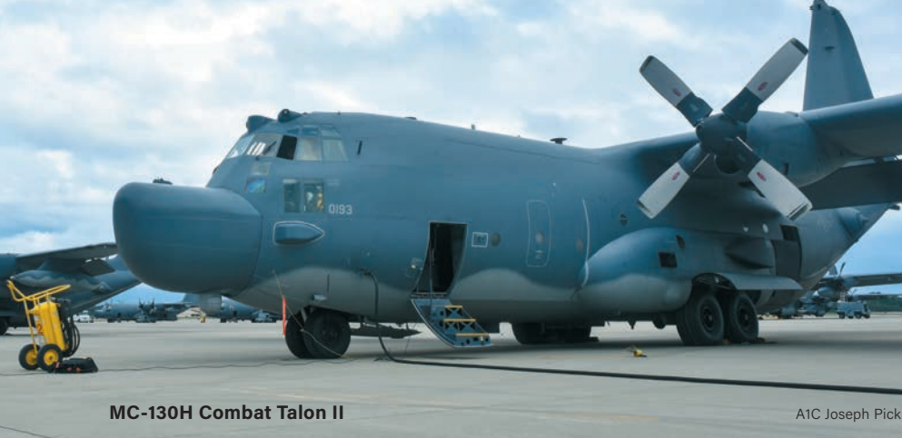
MC-130H Combat Talon II