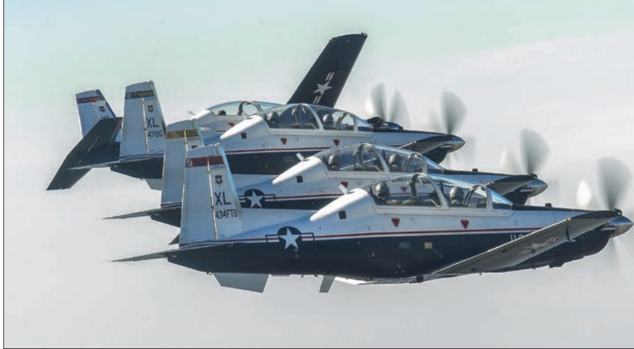
T-6 Texan II