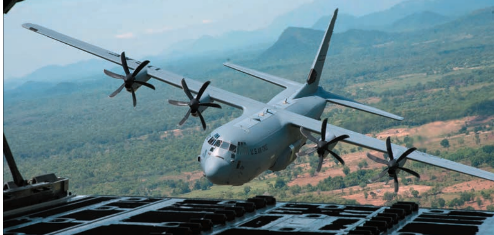
C-130J Super Hercules