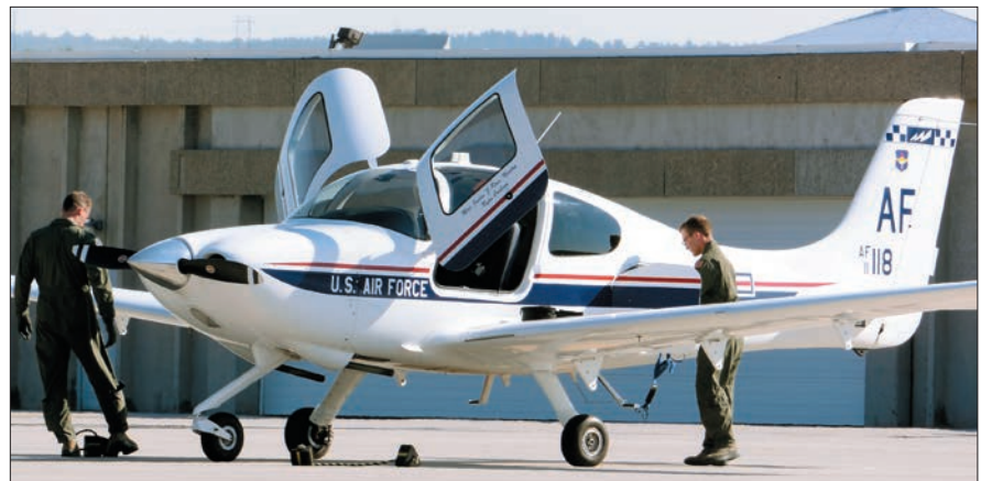
T-53 Kadet II

The MQ-9B is a medium- to high-altitude, long-endurance hunter-killer RPA, primarily tasked with eliminating time-critical and high-value targets in a permissive combat environment. The MQ-9 fulfills a secondary tactical ISR role utilizing its Multispectral Targeting System-B (MTS-B). The system integrates EO/IR, color/monochrome daylight TV, image-intensified TV, and a laser designator/illuminator. MTS-B provides FMV as separate video streams or fused together, and the MQ-9 employs SAR