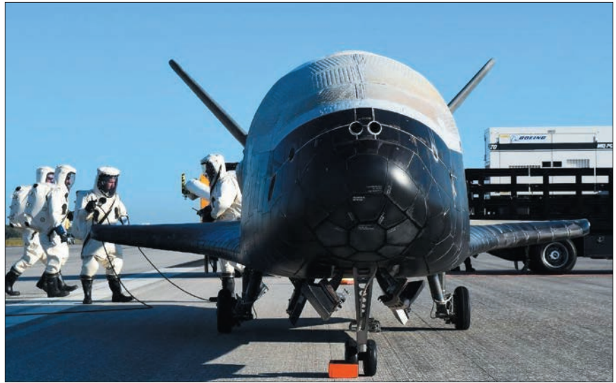
X-37B Orbital Test Vehicle