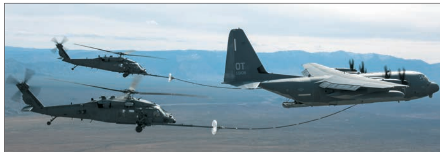
An HC-130J Combat King II refuels two HH-60 Pavé Hawks

The HC-130N/P conducts operations to austere airfields and denied territory for expeditionary, all-weather personnel recovery operations including airdrop, helicopter air-to-air refueling, and forward area refueling point missions. Secondary roles include humanitarian assistance, disaster response, security cooperation/aviation