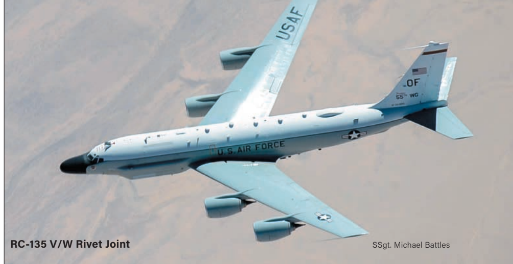
RC-135 V/W Rivet Joint