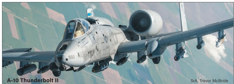
A-10 Thunderbolt II

The F-15 was the world's dominant air superiority fighter for more than 30 years. F-15C/Ds began replacing F-15A/Bs in 1979 and offered superior maneuverability and acceleration, range, weapons, and avionics. It incorporates internal