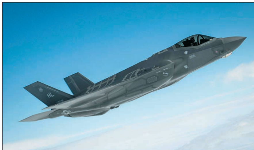
F-35A Lightning II