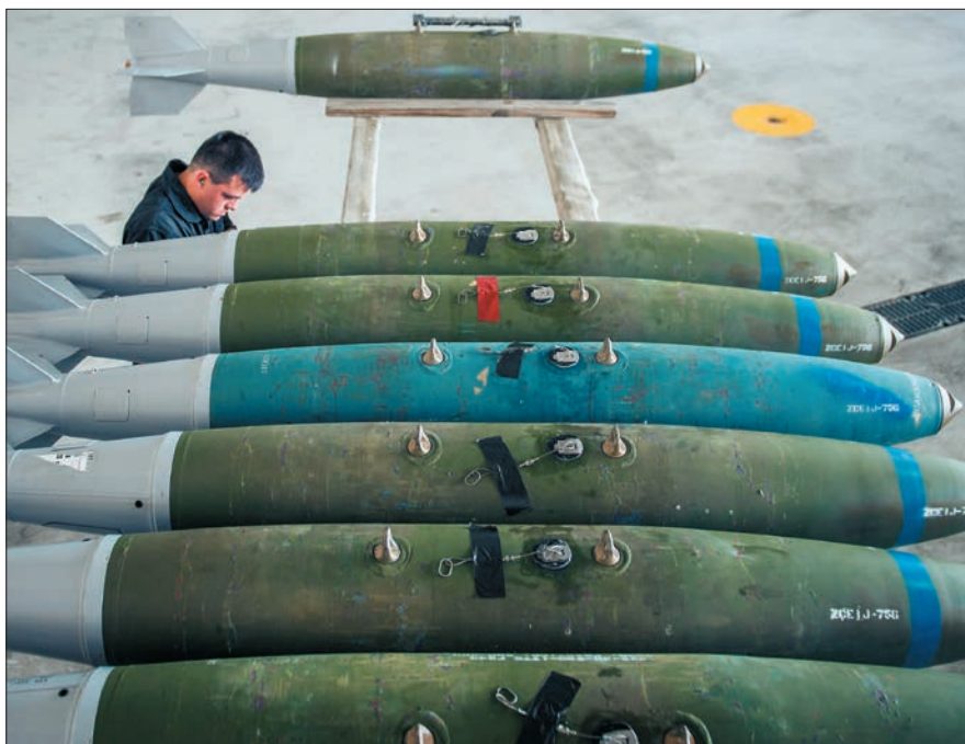
GBU-38 Joint Direct Attack Munition

JDAM is a joint USAF-Navy program that upgrades the existing inventory of general-purpose bombs by integrating them with a GPS/INS guidance kit to provide accurate all-weather attack from medium/high altitudes. The weapons acquire targeting information from the aircraft's avionics system. After release, an inertial guidance kit directs the weapon, aided by periodic GPS updates. JDAM seeker/tail kits can be mounted on general-purpose or penetrating warheads in each weight class. A JDAM kit is under development for the 5,000-lb BLU-113 penetrating weapon, slated for integration and flight testing on the F-15E. The Advanced 2,000-lb (A2K) BLU-137/B weapon is also being developed for integration onto the F-15E and B-2A. A2K will improve both precision and penetration to strike a wider variety of targets.