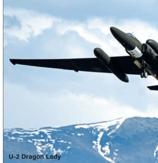
U-2 Dragon Lady

• RC-135V/W Rivet Joint. Self-contained standoff airborne Sigint variant of the C-135. • TC-135W. Training version of the operational aircraft.