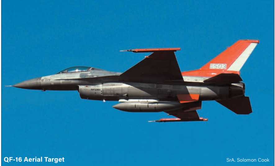
QF-16 Aerial Target

Power Plant: Block 15: one Pratt & Whitney F100-PW-200 turbofan, 23,830 lb thrust. Block 25: one Pratt & Whitney F100-PW-220 turbofan, 23,830 lb thrust. Block 30: one General