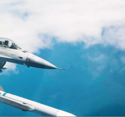
TSgt. Gregory Brook

the similar Hybrid Flight Control Computer/A-GCAS for Pre-Block aircraft equipped with analog flight-control systems will conclude in 2018, paving the way for A-GCAS installation fleetwide by 2022. Ongoing upgrades include SLEP, AESA radar retrofits, MIDS/JTRS to enable higher capacity, jam-resistant Link 16 networking, Aggressor capability improvements, and low-cost mods. Depot-level SLEP extending fatigue life to 10,000 hours or beyond will start in 2019. AESA radar upgrades NORAD alert aircraft to counter cruise missile threats and includes additional capability improvements. Development includes mission computer, sensor, radar, and self-defensive suite capability enhancements, and fourth/fifth gen fighter network capabilities. JASSM-ER integration is slated for completion in 2018. New starts include HFLCC/A-GCAS, mandated airspace compliance mods, comm modernization, and digital RWR. FY18 funds add two F-16 training squadrons to address pilot shortage.