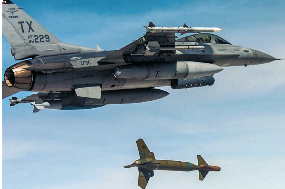
GBU-24 Paveway III

SDB is a low-yield, all-weather precision guided munition designed to limit collateral damage and