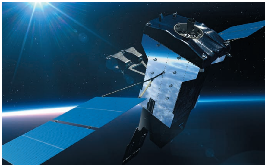
Space Based Infrared System

WGS is designed to provide worldwide communications coverage for tactical and fixed users and to augment and then replace DSCS X-band frequency service. Augments the one-way Global Broadcast Service Joint Program Ka-band frequency capabilities. WGS satellites also provide a new high-capacity two-way Ka-band frequency service. Block I includes: SV-1 (Pacific region), SV-2 (Middle East), and SV-3 (Europe and Africa). Block II satellites are modified to better support the airborne ISR mission and include: SV-4 (Indian Ocean) and SV-5 and SV-6, purchased by Australia in 2013. The US is partnering with Canada, Denmark, Luxembourg, the Netherlands, and New Zealand on Block II follow-on sats SV-7 to SV-10. SV-7 launched in 2015. SV-8 launched into orbit on Dec. 7, 2016, and SV-9 launched March 18, 2017. All four satellites are expected to be aloft and operational by 2019. USAF recently contracted industry to develop