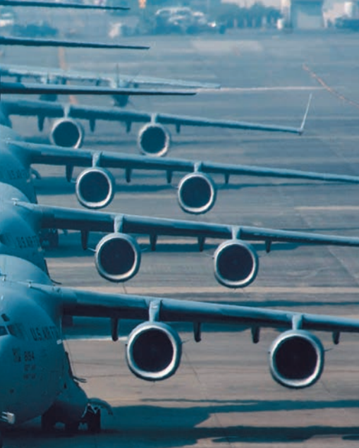
TSgt. Jodi Martinez

Performance: Speed 518 mph at 25,000 ft, range 2,760 miles with 169,000 lb payload.