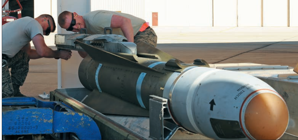
SrA. Cheyenne Powers

- AGM-65H. Upgraded B variant. - AGM-65K. Modified EO TV seeker G variant. - AGM-65L. Laser guided EO TV seeker variant for fast moving targets. Function: Air-to-surface guided missile. First Flight: August 1969. Delivered: August 1972. IOC: February 1973. Contractor: Raytheon, Orbital ATK (propulsion). Propulsion: Two-stage solid-propellant rocket motor. Guidance: EO TV guidance system (B/H/K); Imaging IR seeker (D/G); laser seeker (E). Warhead: 125-lb cone-shaped (B/D/H); 300-lb delayed-fuse penetrator (E/G/K). Dimensions: Span 2.3 ft, length 8.2 ft, diameter 12 in. Performance: Supersonic, range 20 miles. Integration: A-10C, F-15E, F-16C/D.