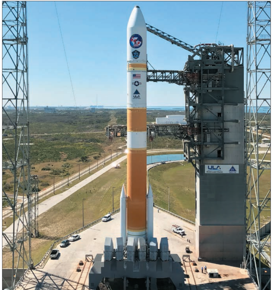
A Wideband Global SATCOM satellite atop a ULA Delta IV rocket