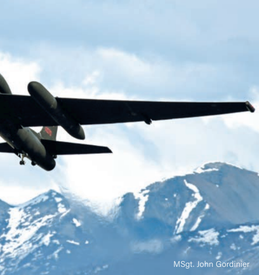
MSgt. John Gordinier

the U-2 before the fleet is phased out, initially delaying retirement to FY19. U-2s are heavily tasked meeting operational demands, and retirement would reduce high altitude ISR capacity by 50 percent, prompting USAF to delay retirement to 2022 or beyond. Future funds were limited to flight safety and sustainment, unless critical to national security. Ongoing upgrades now include ASARS development, integration, and testing, as well as multi-spectral sensor, EW system, Optical Bar Camera, and Sigint package upgrades. Additional improvements include defensive systems, data links, and avionics, as well as flight safety and airspace compliance mods.