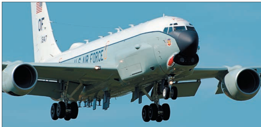
RC-135U Combat Sent

The U-2 is the Air Force's manned high-altitude ISR platform, capable of carrying multiple, simultaneous intelligence sensors. U-2 can carry a variety of advanced optical, multispectral EO/IR, SAR, Sigint, and other payloads. U-2 was initially designed in the 1950s and further developed as the U-2R in the late 1960s. Current U-2s date to the 1980s when production was reopened to produce the larger and more capable TR-1. S model conversions began in 1994, and all current aircraft are Block 20 configured, featuring a glass cockpit, digital autopilot, modernized EW system, and updated data links. Sensor upgrades include the ASARS-2A SAR sensor, SYERS-2A multispectral EO/IR imagery system, and enhanced Airborne Signals Intelligence Payload (ASIP). The legacy optical bar camera is still in use, providing broad-area synoptic imagery coverage. U-2's modular payload and open system architecture allow new sensors to be rapidly fielded to meet emerging needs. USAF planned to start retiring the fleet in FY16 due to budget constraints. Congress stipulated the RQ-4 Block 30 achieve sensor parity with