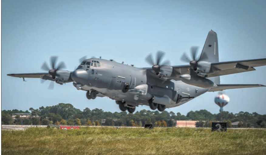
AC-130J Ghost Rider