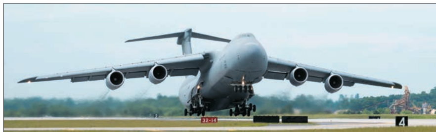
C-5M Super Galaxy