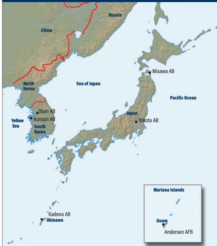
All bases on this map are PACAF bases.