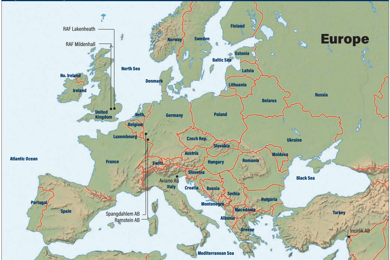
All bases on this map are USAFE bases.