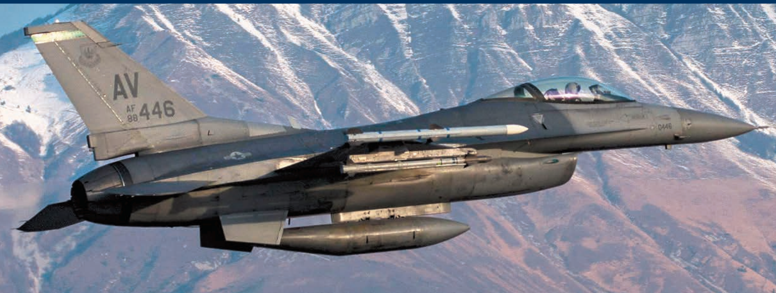
An F-16 takes off from Aviano AB, Italy