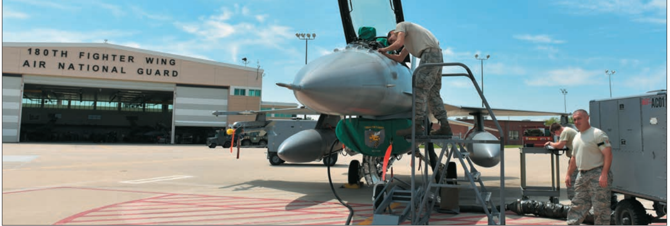
An F-16 at Toledo Express Arpt., Ohio