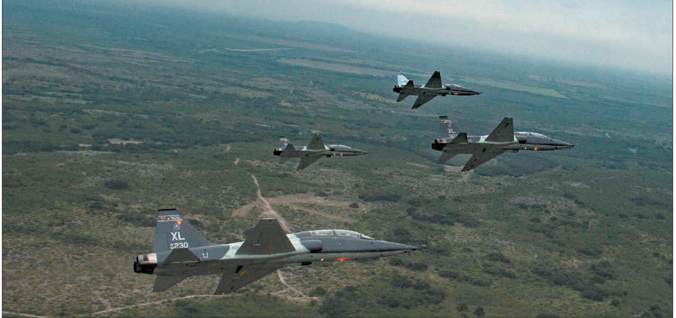
T-38s fly near Laughlin AFB, Texas