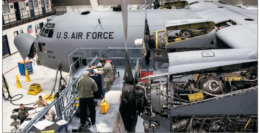
A C-130H is inspected at Mansfield Lahm Arpt., Ohio.

Jacksonville Arpt., Fla. 32218. Nearest city: Jacksonville. Phone: 904-741-7100. Component: ANG. Unit/mission: 125th FW, fighter, ISR operations.