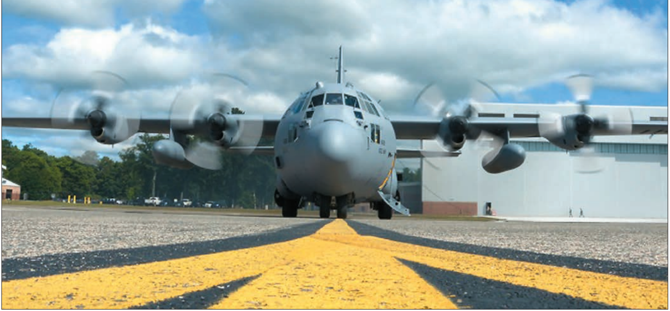
A C-130 at Bradley ANGB, Conn.