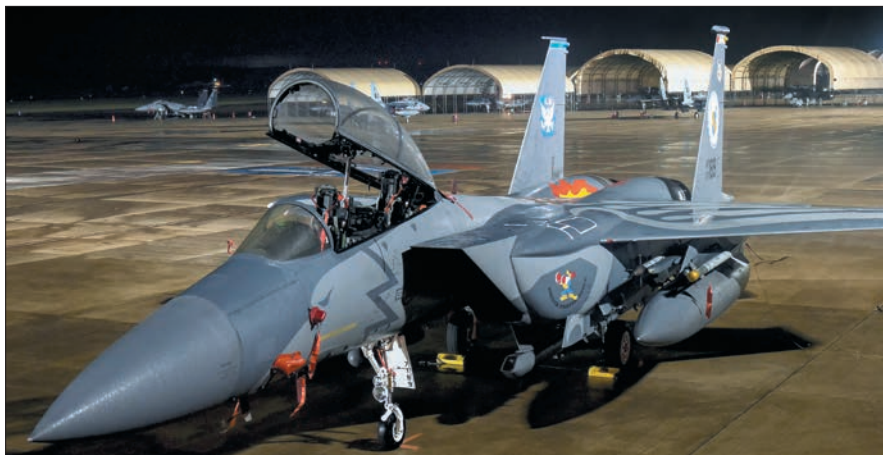
An F-15E at Seymour Johnson AFB, N.C.

Yokota AB, Japan, APO AP 96328. Nearest city: Tokyo. Phone: 011-81-311-755-1110. Owning command: PACAF. Unit/mission: 374th AW (PACAF), air mobility, personnel recovery operations; 515th AMOG (AMC), air transportation services; Hq. 5th Air Force (PACAF), Hq. US Forces Japan (PACOM), operational leadership. History: opened as Tama AAF by Japan 1939. Turned over to US forces and renamed Yokota AB Sept. 6, 1945.