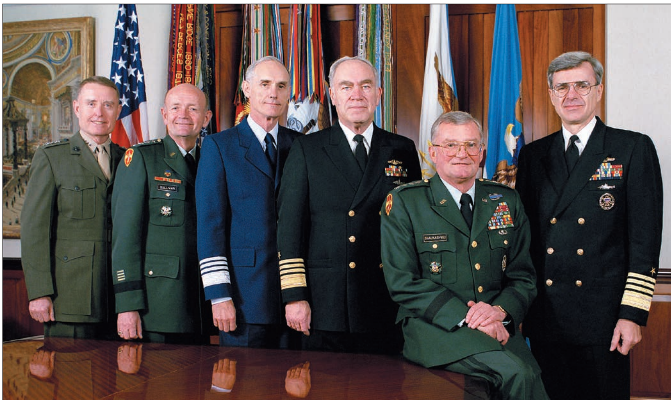
The Joint Chiefs of Staff in 1994 (left to right): Gen. Carl Mundy, Commandant of the Marine Corps; Gen. Gordon Sullivan, Chief of Staff, Army; Gen. Merrill McPeak, Chief of Staff, Air Force; Adm. Frank Kelso II, Chief of Naval Operations; Army Gen. John Shalikashvili, Chairman of the Joint Chiefs of Staff; and Adm. William Owens, Vice Chairman of the Joint Chiefs of Staff.