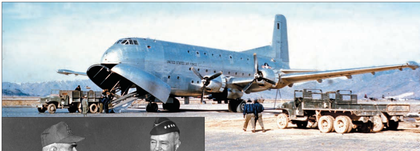
The C-124 Globemaster considerably improved USAF airlift capability in the Far East in the 1950s.