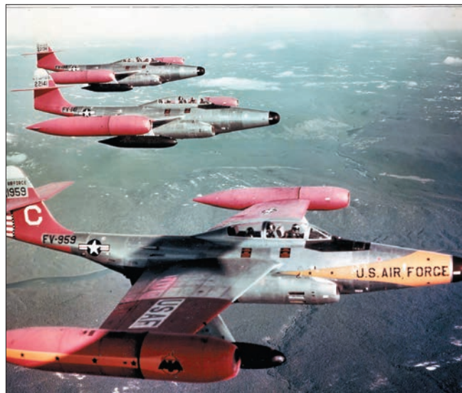
F-89D Scorpion interceptors from the 1950s belonging to Air Defense Command.

Antecedents: AAF Materiel and Services 1944; AAF Technical Service Command 1944; Air Technical Service Command 1945; Air Materiel Command 1946; Air Force Logistics Command 1961. Inactivated July 1, 1992.