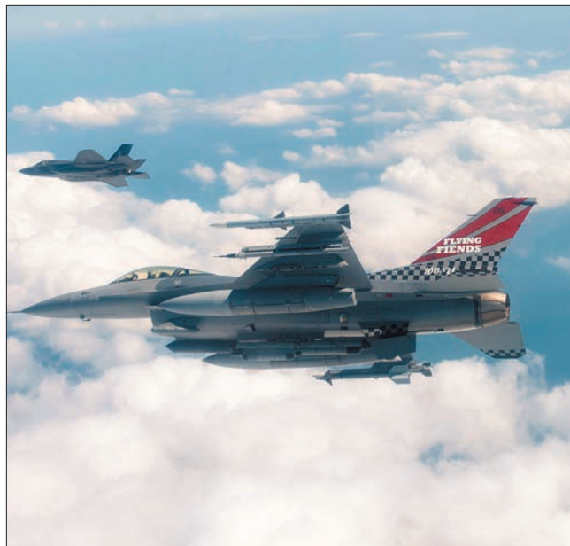
Over the Korean Peninsula, an F-16 from the 51st FW, Osan AB, South Korea, shares the sky with a Marine Corps F-35B stealth fighter.