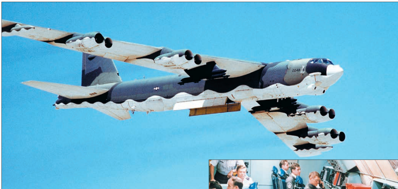
A SAC B-52H Stratofortress during the multinational joint service Exercise Bright Star '85 out of Cairo West AB, Egypt.