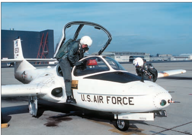
A student and instructor pilot at Air Training Command's undergraduate navigator school prepare for flight in a T-37 aircraft at Mather AFB, Calif.

Established Dec. 1, 1948. Inactivated Aug. 1, 1968.