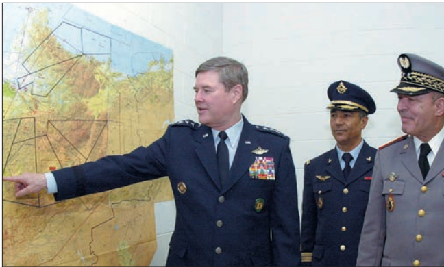
USAF Gen. Joseph Ralston (I) Supreme Allied Commander, Europe, at Sidi Slimane AB, Morocco, looks over a theater of operations map with the Moroccan Chief of Staff.

This section presents the leaders of DOD's unified commands, the National Guard Bureau, and NORAD under the current designation. Leaders of historic DOD commands (and of active commands' previous designations) are listed in the next section.