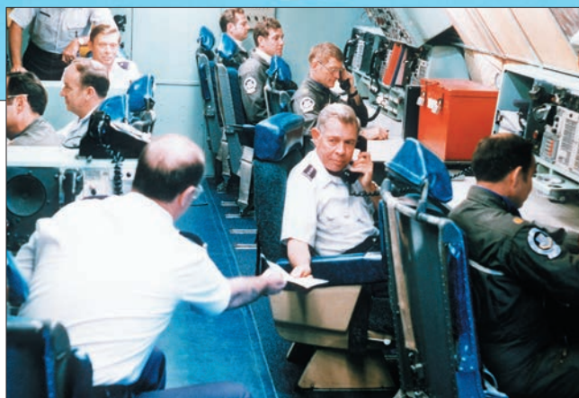
SAC Chief Gen. Richard Ellis (r) receiving top-level communications in his airborne command post on Dec. 1, 1979.